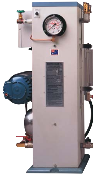
SB 3S SERIES 20 TO 42 KILOWATTS