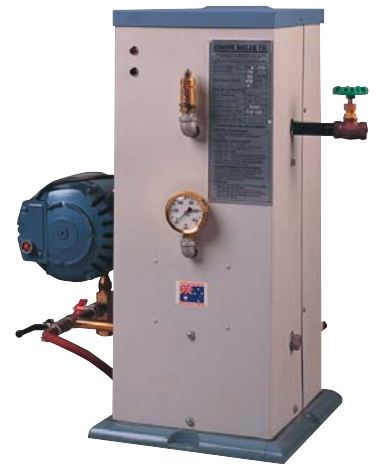
SB 2S SERIES 3.6 TO 14 KILOWATTS