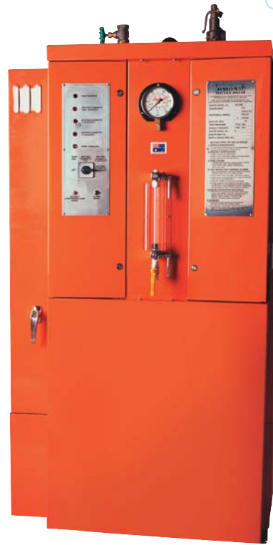
VS 610 SERIES 80 TO 480 KILOWATTS