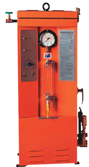
VS 300 SERIES 10 TO 80 KILOWATTS